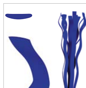
Fibre thickness: approx. 110 µm